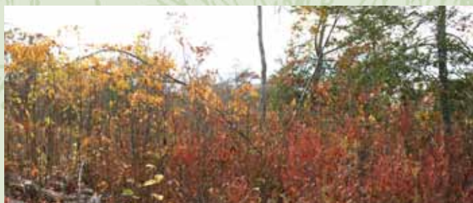
Timber harvests yield thick new growth for wildlife.

Woodcock numbers, as indexed by the annual Singing-Ground Survey, recently have stabilized and, since 2008, generally have risen. Many scientists believe this population turnaround comes from the thousands of acres of new habitat created through the Young Forest Project.