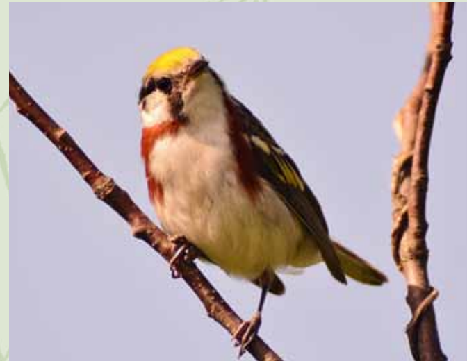
The chestnut-sided warbler is one of many birds that need the food and cover provided by thick growth of trees and shrubs found in areas of young forest./Tom Berriman