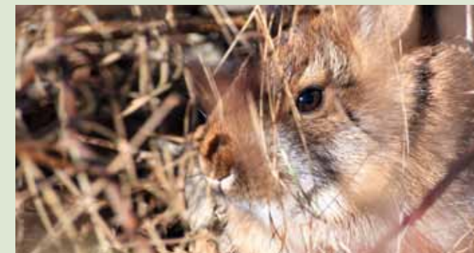
Woodcock habitat provides great homes for rabbits.

Cutting out shade-casting trees spurs the growth of apple trees and sun-loving shrubs, beneath which woodcock find abundant earthworms to eat. The apple trees and shrubs provide fruit for other animals.