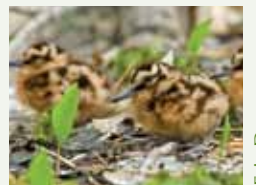
Woodcock raise their chicks in stands of young hardwoods.

Woodcock raise their young in stands of hardwood trees less than 20 years old – where the saplings are so thick that a person might have trouble getting through. Alder and willow flycatchers thrive in these areas, as do snowshoe hares and cottontail rabbits.