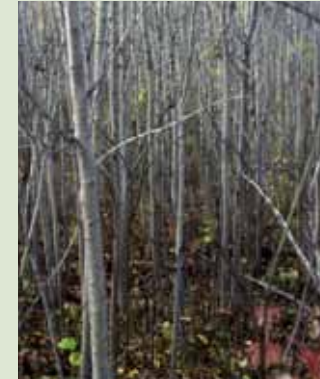
Woodcock thrive in aspen thickets.

Abandoned fields can be planted with light-loving shrubs and trees (alders and aspens are top choices) to create wildlife-friendly young forest.