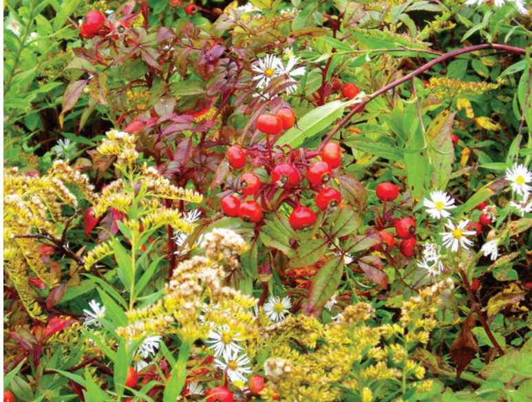
Native goldenrod, aster, and Virginia rose