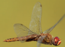
Spot-winged glider dragonfly