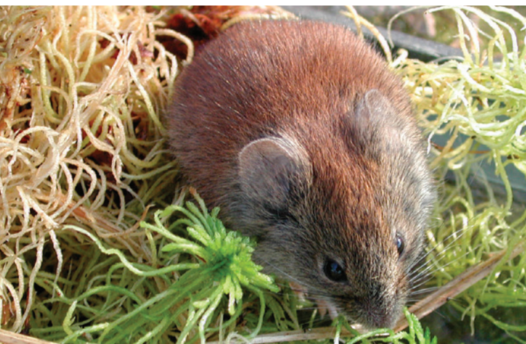
Southern red-backed vole

T rees have grown taller and begun shading out some lower plants, but the habitat remains thick, providing ample food and cover. Populations of tree-feeding caterpillars increase. Birds peak in abundance and diversity: ruby-throated hummingbirds, black-and-white warblers, veeries, and eastern towhees are a few of the many birds you may see during the breeding season, while others show up during spring and