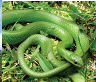
Smooth green snake