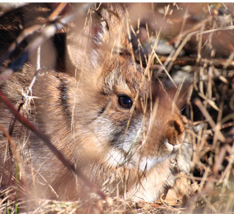
New England cottontail

Remember, each habitat project will look a bit different because of soil characteristics, the amount of sunlight a site receives, or the types of plants and seed sources present. Also, the years when various animals appear may differ from site to site. Different animals may use the habitat at different times of the day, including at night. Some will breed and feed there in spring and summer, while others will rely on food and cover resources during spring and fall migrations or in winter.