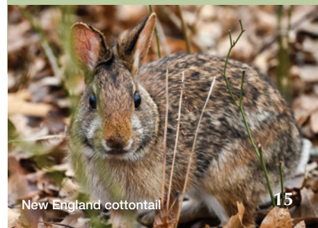
New England cottontail