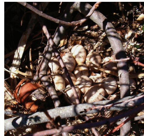
Wild turkey nest