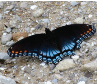
Red-spotted purple butterfly